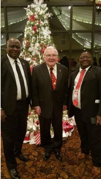
December Pancake Breakfast – proceeds to Sharing & Caring Hands