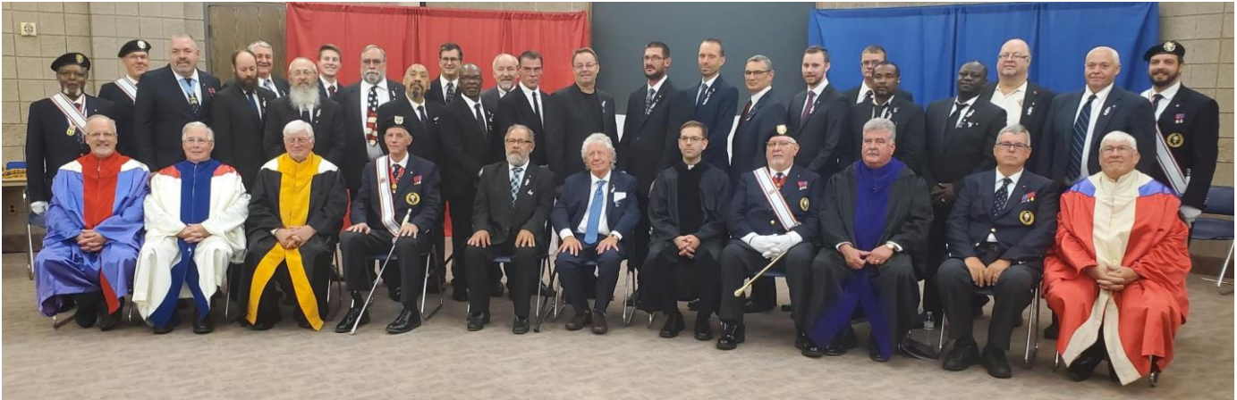
Summer 2022 4 th Degree Exemplification with 22 New Members